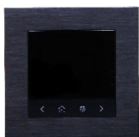
BK - Black Frame