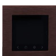
BR – Brown Frame