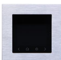
SL - Silver Frame